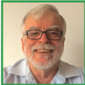
Professor Warwick Middleton

October 30, 2020 | 10:00AM – 5:30PM Eastern Daylight Time